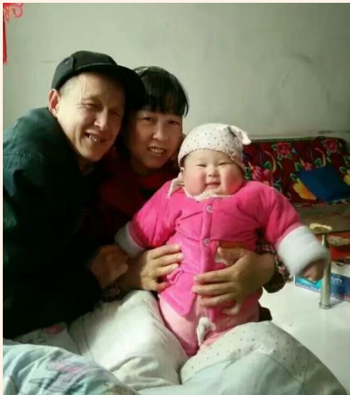
My parents with my niece