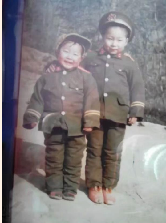
My brother and me